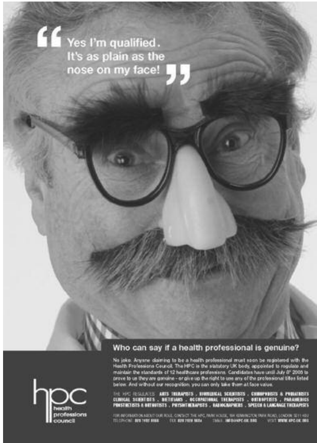
One of our adverts from the 2004/2005 campaign