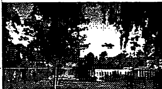
Redwood Lodge Hotel