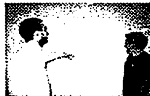
Identifying future approaches to mental health education