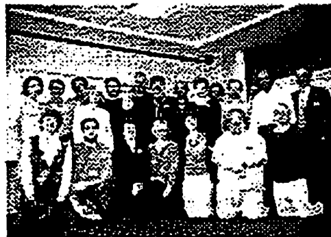
Participants at the York meeting